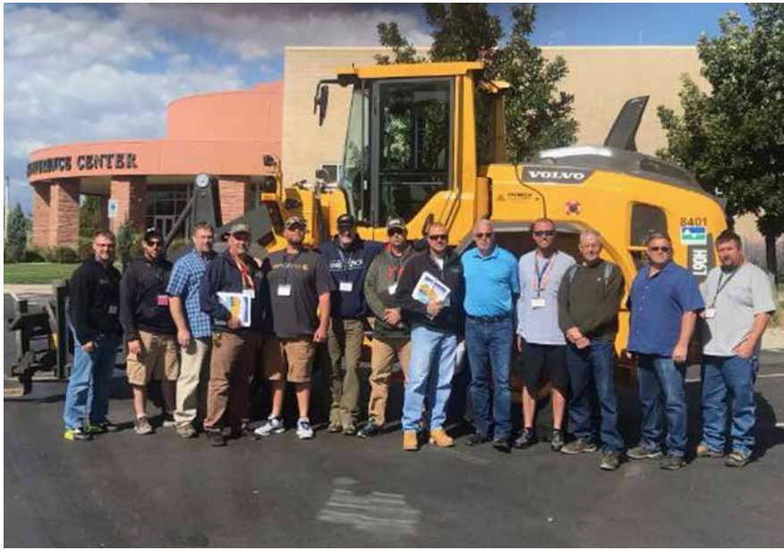
Participants from Massachusetts, Connecticut and Rhode Island at the National Conference