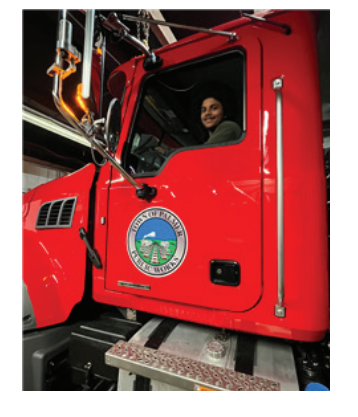
Photo3 Tyshauwn at the Palmer DPW

Photo 2 Tyshauwn (at right) at the Career Fair.